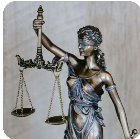
Is robust law and order the answer?