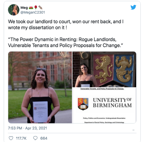
This student's victory tweet went viral